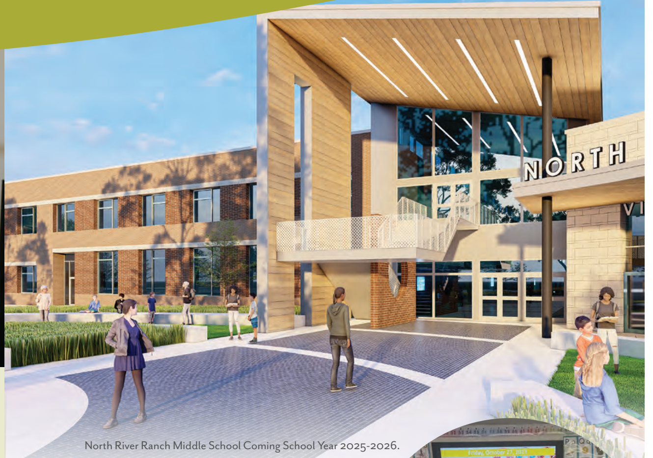
North River Ranch Middle School Coming School Year 2025-2026.