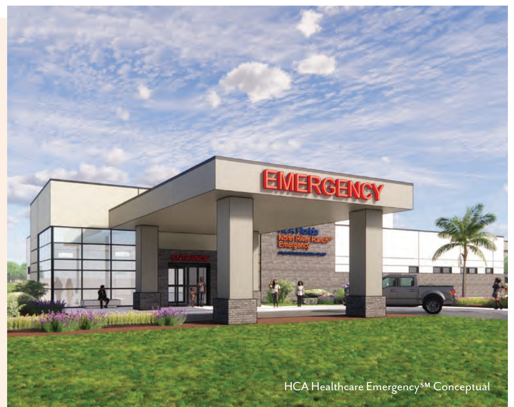
HCA Healthcare Emergency SM Conceptual