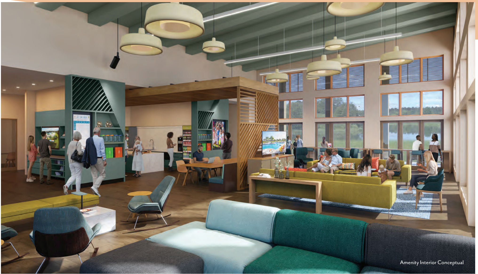
Amenity Interior Conceptual