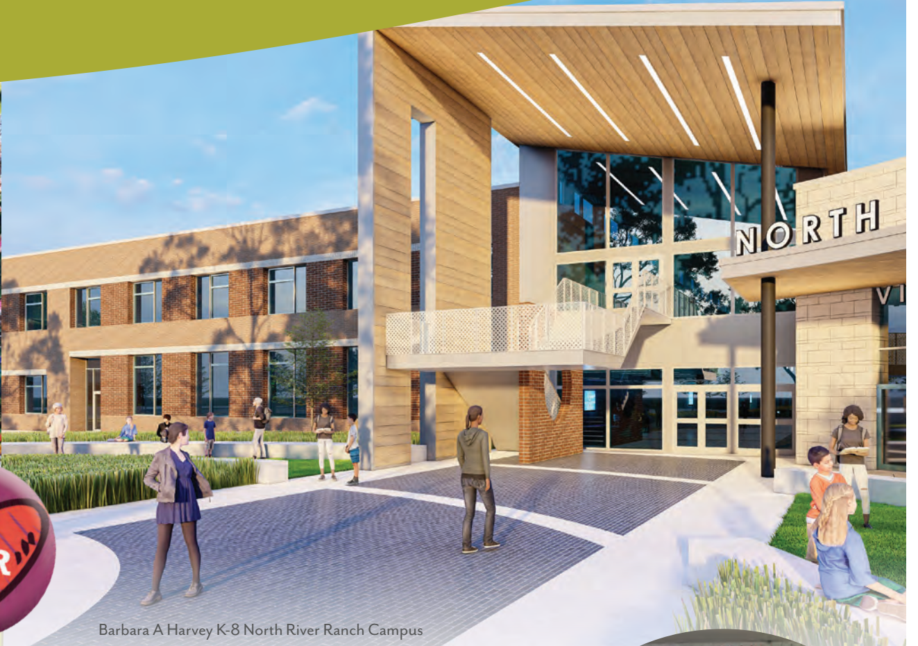
Barbara A. Harvey K-8 North River Ranch Campus